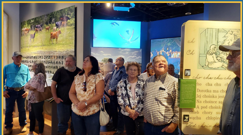
Kosciusko seniors at the Center