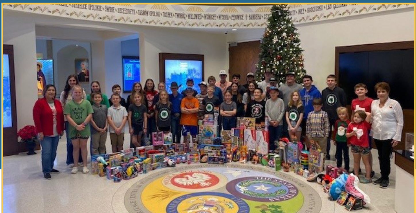
Panna Maria 4-H Club Christmas party and Toys for Tots drive