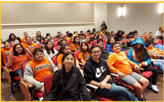
Karnes City 5th graders fill the PHC theater