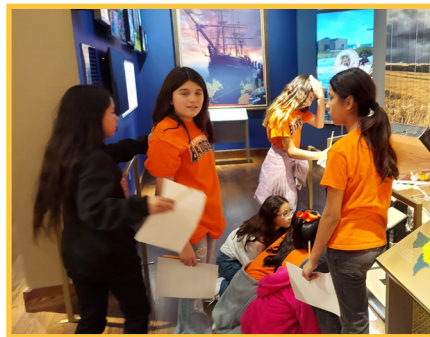
KC 5th grade searching for scavenger hunt answers