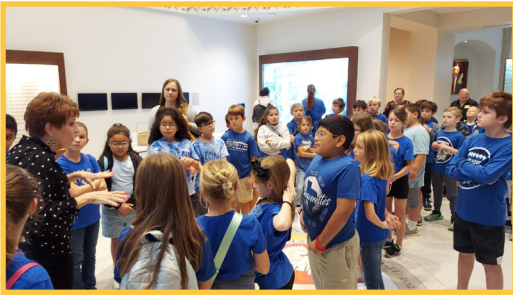
FC students are quizzed on their knowledge of Polish heritage