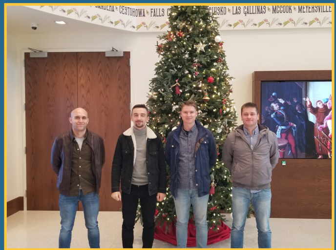
Polish pilots training in Texas visit the PHC